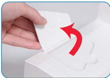
Easy-to-use infeed extension supports large envelopes up to 10" x 13"